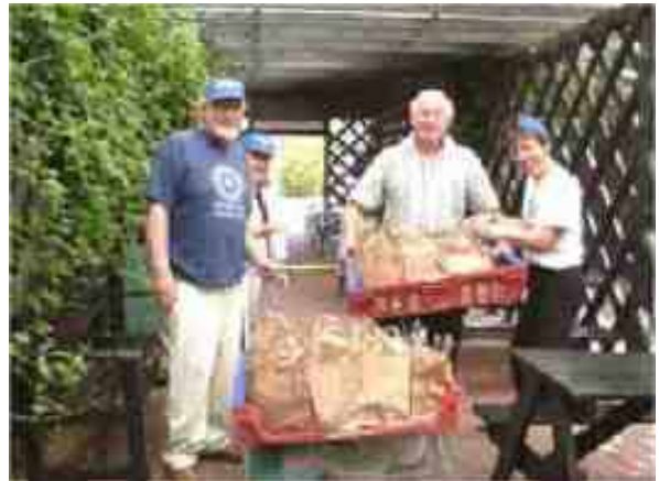
Who ordered the Chicken Rice?

Wednesday 9 th June was Rotary Kids-Out Day and once again Ipswich Orwell were pleased to participate. Six Rotarians accompanied families from The Stone Lodge Lane Family Centre on a day out at Colchester Zoo. A total of 40 parents and children were transported from their homes to the centre and then by coach to the zoo. The weather was kind and a most enjoyable day was had by all.