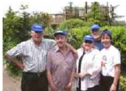
My prefects won't take any nonsense

Packed lunches and other goodies were provided by the Club, who received a nice letter of thanks from Stone Lodge Family Centre.