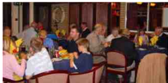
Supper At Felixstowe Ferry Sailing Club